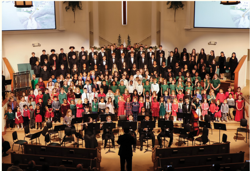
Our FCS students performing at our Christmas Program last year!