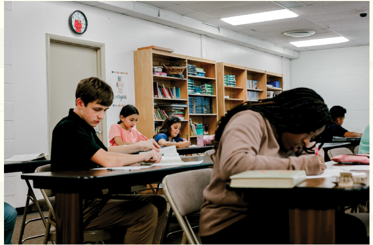
The 6th grade class diligently working on their short entries.